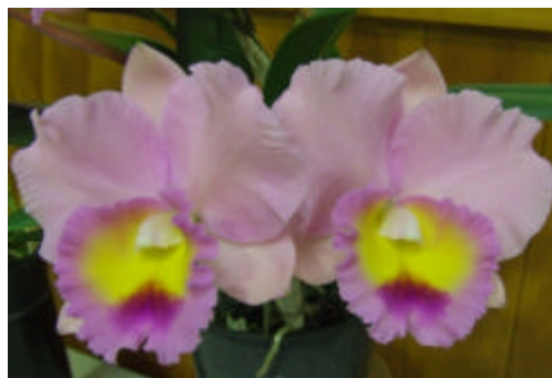
Sc Dal's Choice