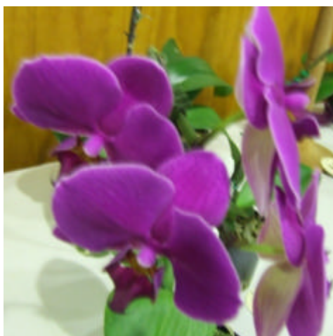
Dtps Jiuobao Red Rose