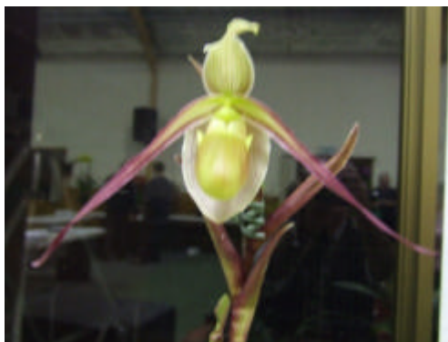
Phrag longifolium 'Mac'