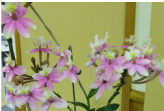
Epi Wedding Valley "Sakura Komachi"