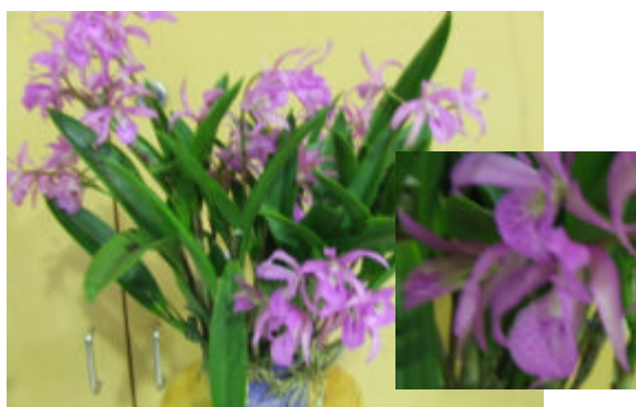
Bsn Mailai 'Mayumi'