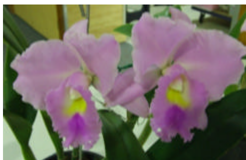
Rlc Misaki Song

'May Your Orchids Bloom' From the Wee Leprechaun